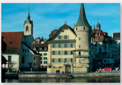
St. Peter's Chapel and Zur-Gilgen Tower

Many towers and a large part of the wall were lost as the town expanded. There now remain 13 towers. Towards the end of the 19th century there was even talk of dismantling the Chapel Bridge once the See Bridge was built. Sense prevailed, fortunately. The Spreuer Bridge was also saved for posterity.