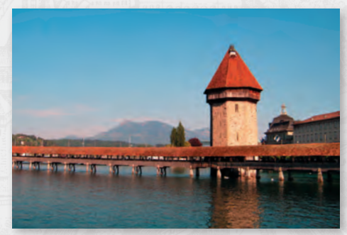
Chapel Bridge with Water Tower

Built around 1300, i.e. before the Chapel Bridge, the octagonal Water Tower stands in the middle of the River Reuss. The tower served as a fortification and lookout post and was a cornerstone of the defences. Over the ensuing years it was used to store the town's archives and treasure, and it even saw use as a prison and torture chamber. For the past number of years Lucerne has leased the Water Tower to the Artillery Association. Over 34 metres in height, this Lucerne landmark is Switzerland's most-photographed monument.