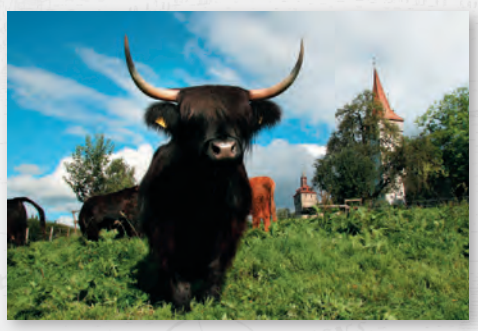
Bucolic scene by the Musegg Wall

870 m in length, the Musegg Wall and its nine extant towers rank amongst the town's most important monuments. The Musegg Wall and most of the extant towers are now thought to have been built between 1370 and 1420.