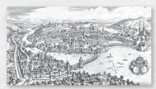
Lucerne, copperplate engraving by Matthäus Merian, 1642

Lucerne became a town in the 12th century. The abbot of Murbach installed Lucerne's first priest in St. Peter's Chapel in 1178. On 1 August 1291 Cantons Uri, Schwyz and Unterwalden established the Swiss Confederation. Lucerne was sold to the Habsburgs. The Battle of Morgarten in 1315 saw the Old Confederacy defeat the Habsburgs.